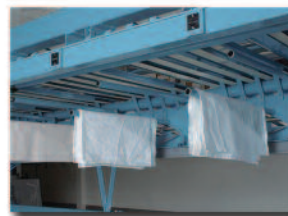
5 Lane Small Piece Visa® Accumulator