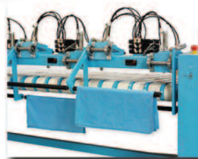
Small Piece Rotary Accumulator Available in 4 or 5 lane configurations.

The Braun (optional) 4 or 5 lane small-piece accumulators operate as an integral part of a primary folder or Folder/Cross-Folder. By using a multiple drape collection system, the system collects small items in preprogrammed bundle counts, allowing one operator to collect items processed by all lanes.