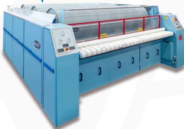
Braun Delta Flatwork Ironer Large Diameter Rolls