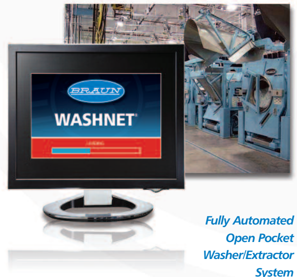
Fully Automated Open Pocket Washer/Extractor System

Whichever model meets your needs, Braun's design engineers will smoothly integrate the new machines into your plant layout to reduce the number of full time employees while optimizing material flow. Braun's team will use