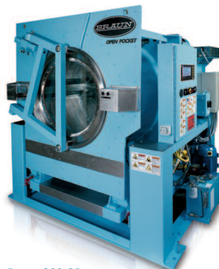
Braun 200 OP

Braun Washer/Extractors are designed in such a way that the load balances itself prior to moving into the extraction phase. By slowly ramping up to a programmable extraction speed, Braun Washer/Extractors evenly distribute the wet goods against the cylinder, eliminating the need for artificial counterbalances. This balance method results in consistent thickness of goods throughout the cylinder, delivering a uniformly extracted load, free of wet clusters which greatly hinder the efficiency of your drying and finishing areas.