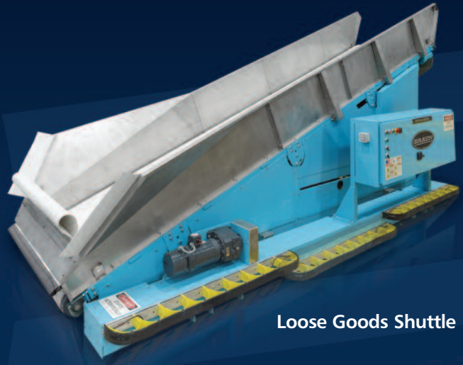
Loose Goods Shuttle