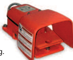
Foot Pedal Interlock