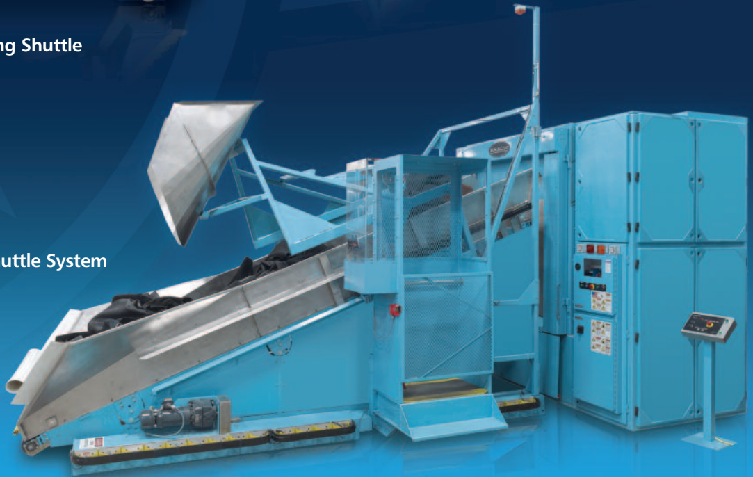
Safeload® Shuttle System