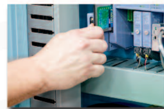
Flashcard for Easy Downloading of PLC Formulas