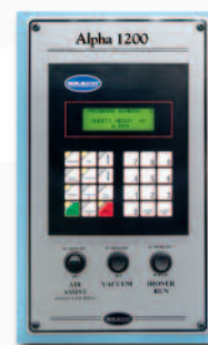
Spanish/English Bilingual Screen Displays